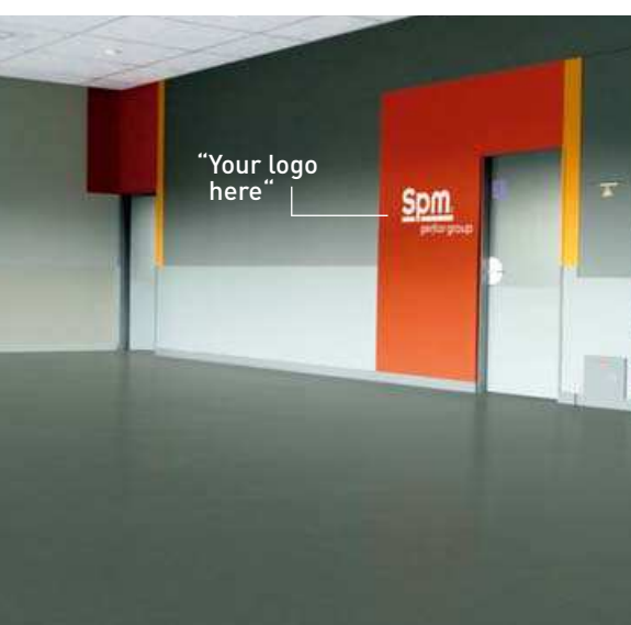
Call your local service for answers to all your questions and to create a customized panel.

The reproduced images or photos, provided by the user in accordance with Gerflor requested specification, must be free of copyright – if they are not, the reproduction rights are payable by the user, who has full responsibility.