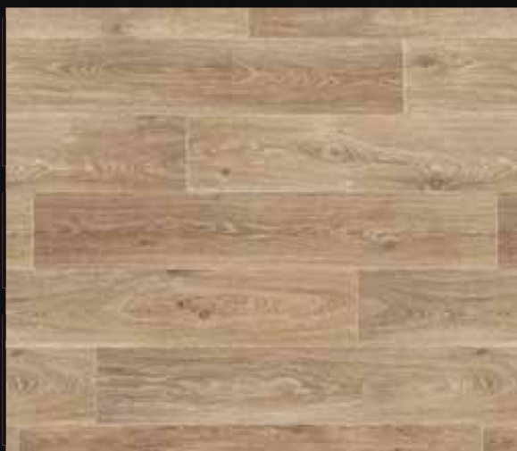
1309 Noma Rustic