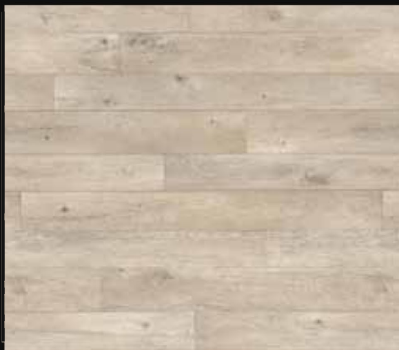
1312 Mambo Ash