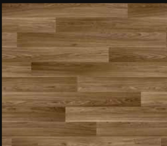
1314 Walnut Brown